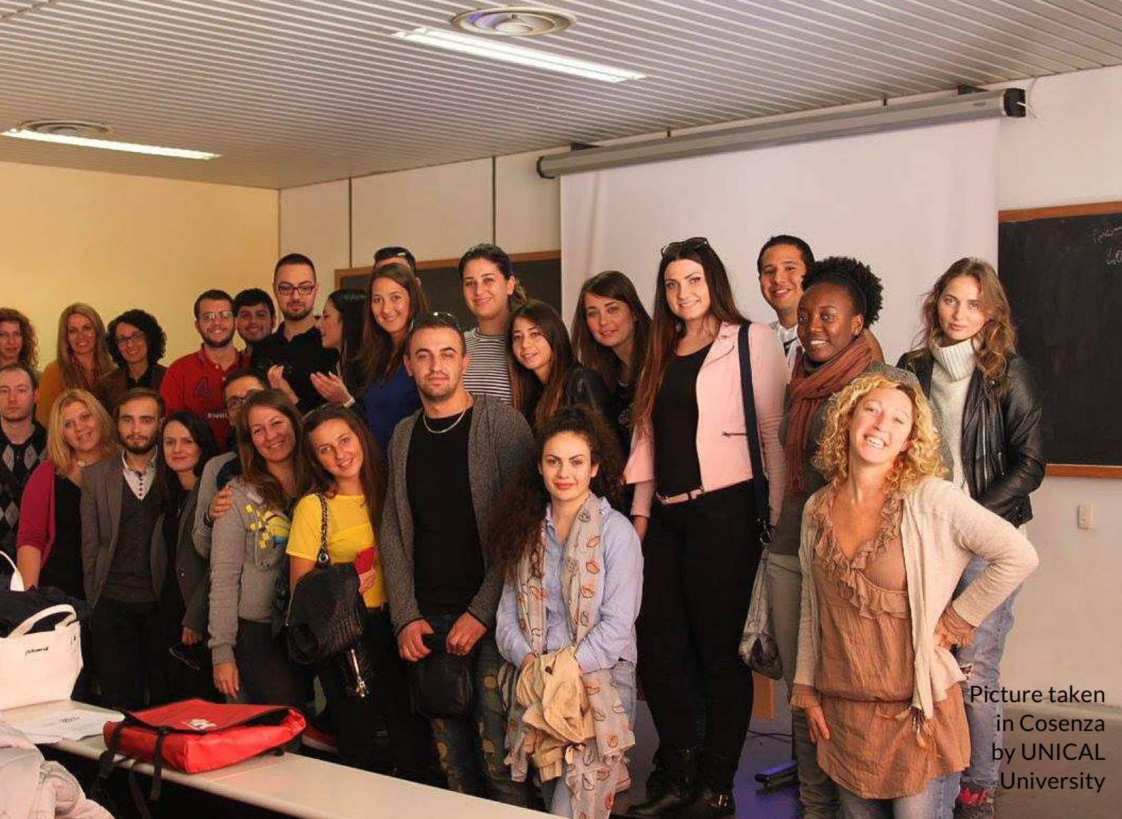
Picture taken in Cosenza